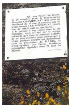
Les Palais du Bessat

At Newman College the JBM Program offers an alternative and authentic pathway for those senior students whose needs and interests are not being met by the mainstream curriculum. It will bring new life and motivation through the positive learning experiences it provides.