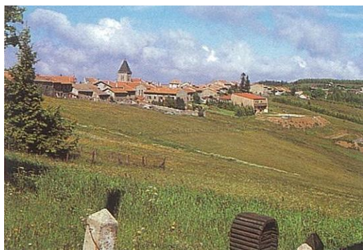
Town of Le Bessat

The Montagne family lived in the hamlet of Les Palais, a half kilometre or so from the nearby town of Le Bessat which is located on a lower ridge of Mount Pilat in the Lyon region in Southern France.